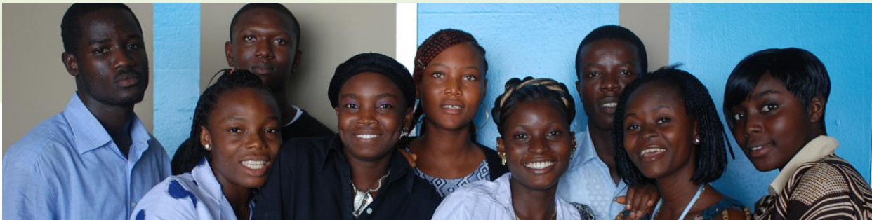
Shirley Ann Sullivan Educational Foundation Youth Volunteers Liberia (SASEF YVL)

These activities reflect active engagement with United Nations Secretariat, programmes, funds and agencies effectively implementing the provisions of the consultative relationship with Economic and Social Council (ECOSOC).