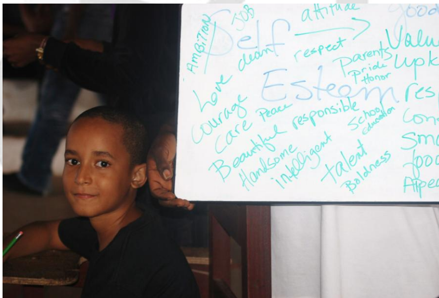
Student from CET Leadership Basketball Camp